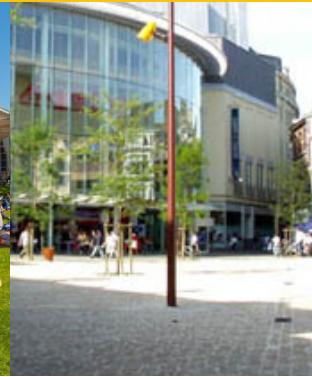
Place St Etienne