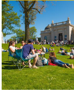
Parc de la Boverie